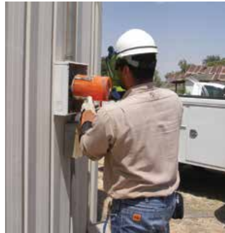
Sensus AMI meter being installed