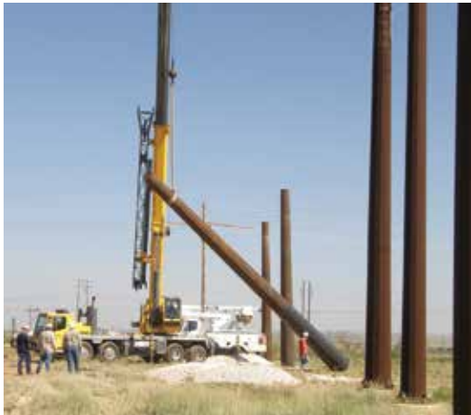
Transmission poles being set.

I hope this report has provided a brief summary of the major activities at CVE in 2014. We are very proud that CVE continues to have low rates with personalized service to members. CVE is financially strong and positioned well to meet the needs of the members. CVE's employees, staff, and board of trustees have worked hard over the past year to provide for the needs of the cooperative, and they remain committed to continued excellent service in the years to come.