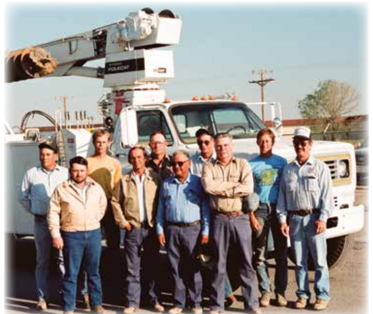
CVE line construction crew from the early 1980s.