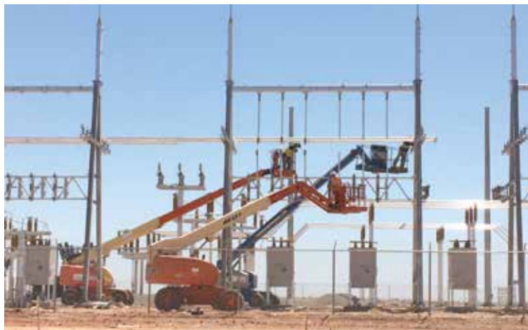
Construction of the new 8 Mile Hill substation.